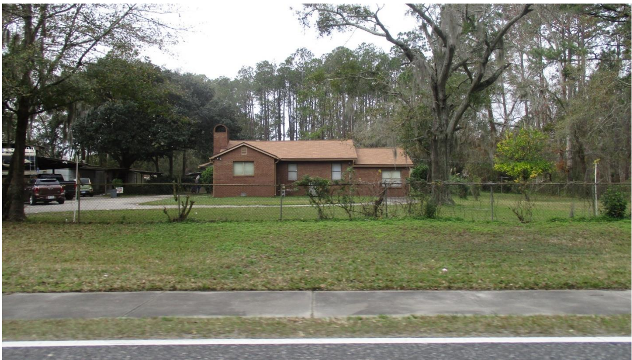
Property to the North: Single Family Dwelling