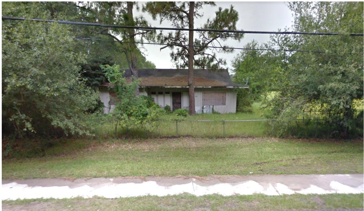
Property to the South: Single Family Dwellings Source: Planning & Development Department 02/21/2019